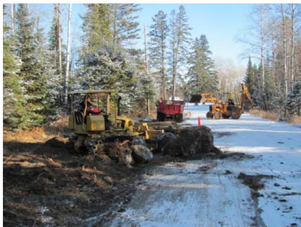
Removing boulders at Bachelor Road reroute

Notice of trail reroute: The former Cloquet River Inn has been converted to residential apartments and the trail will no longer run behind that property. The new routing will now follow the right of way of the Bachelor Rd and connect again to existing trail at the Munger Shaw Rd. Please respect private property and do not use the old trail section.