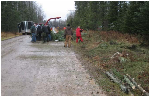
Using chipper on Bachelor Road reroute